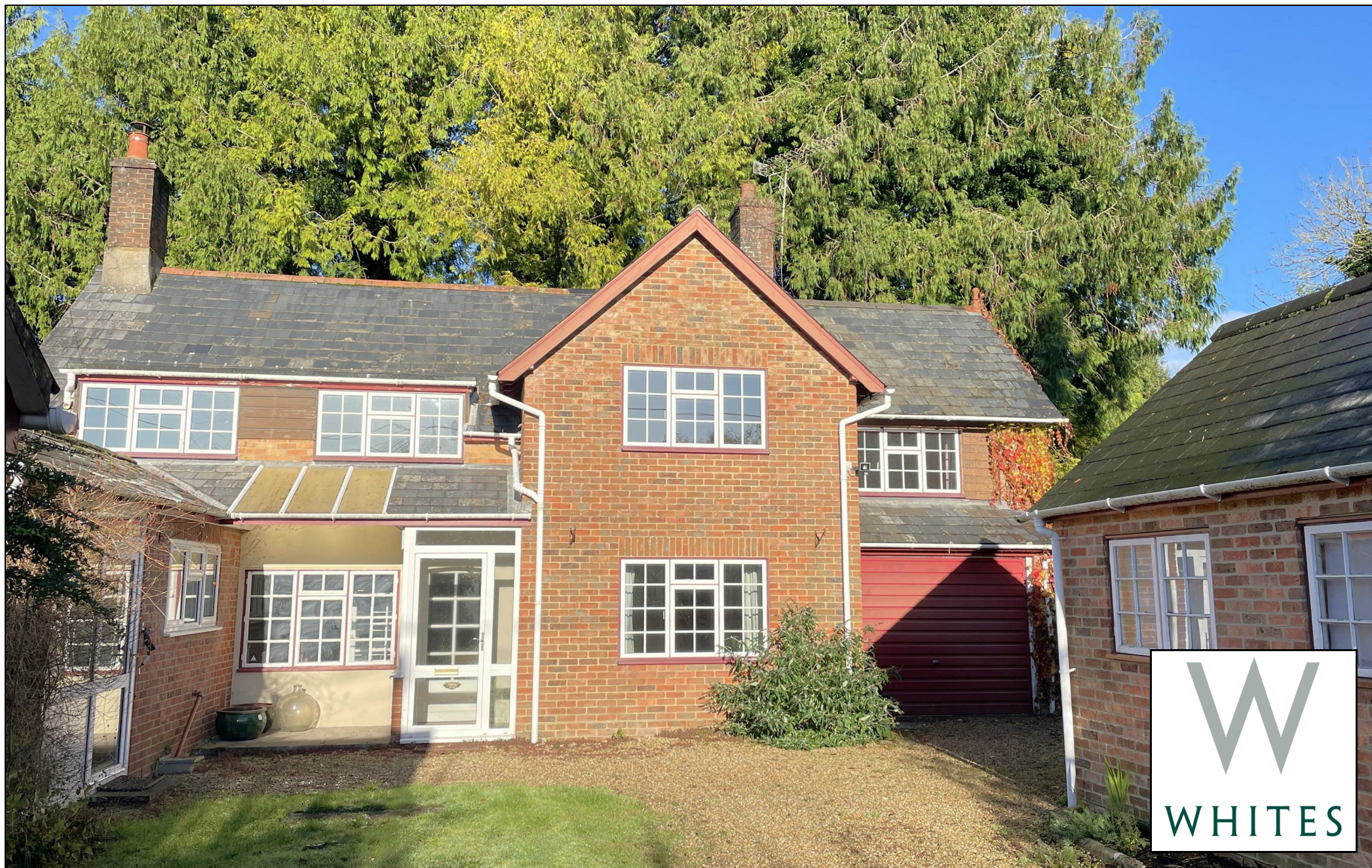
Hydon House High Lane, Broad Chalke, Salisbury, Wiltshire, SP5 5HA