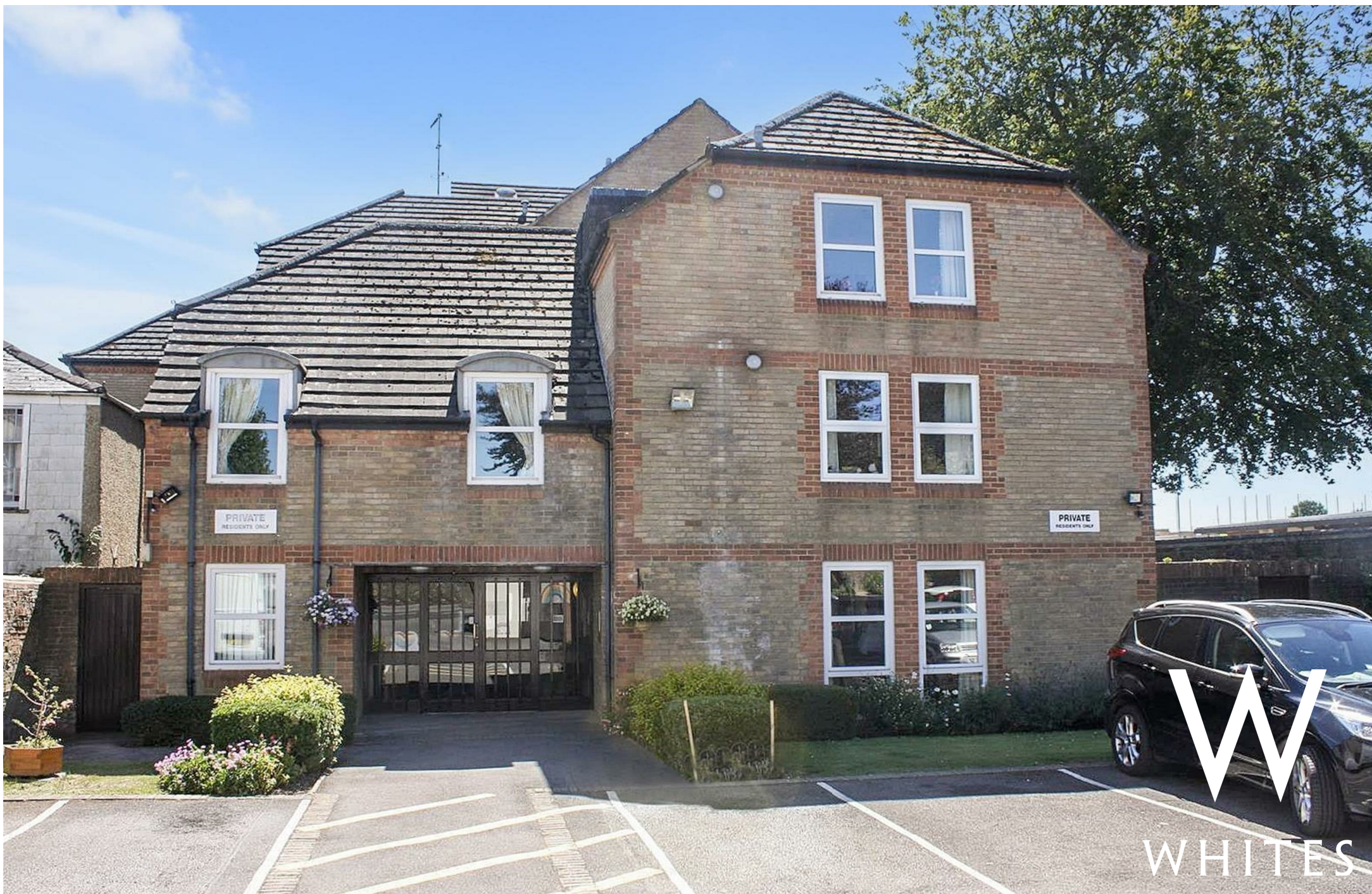
28 Home Sarum House, Wilton Road, Salisbury, Wiltshire, SP2 7HS