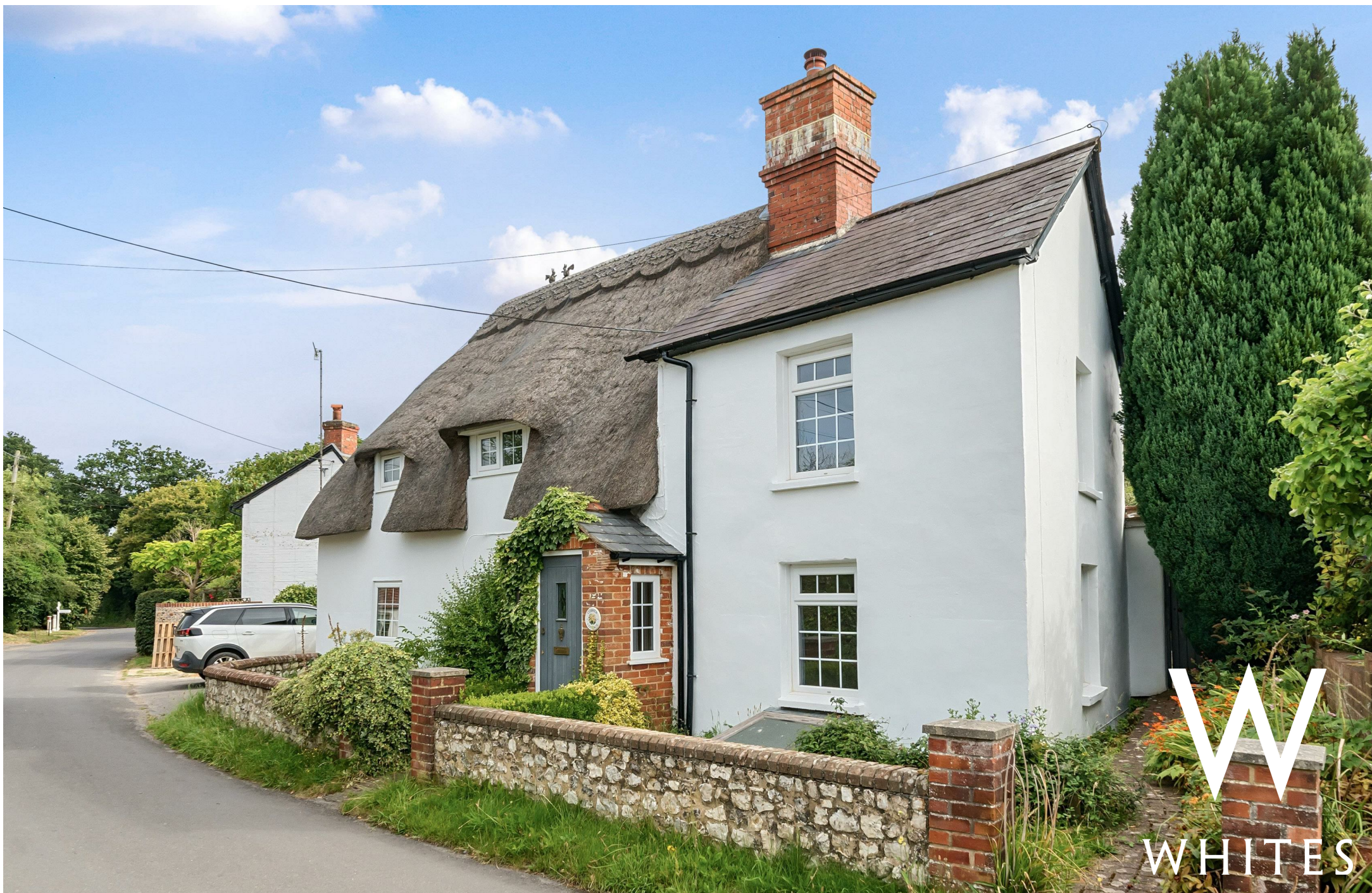
Cobweb Cottage, Netton, Salisbury, Wiltshire, SP4 6AW