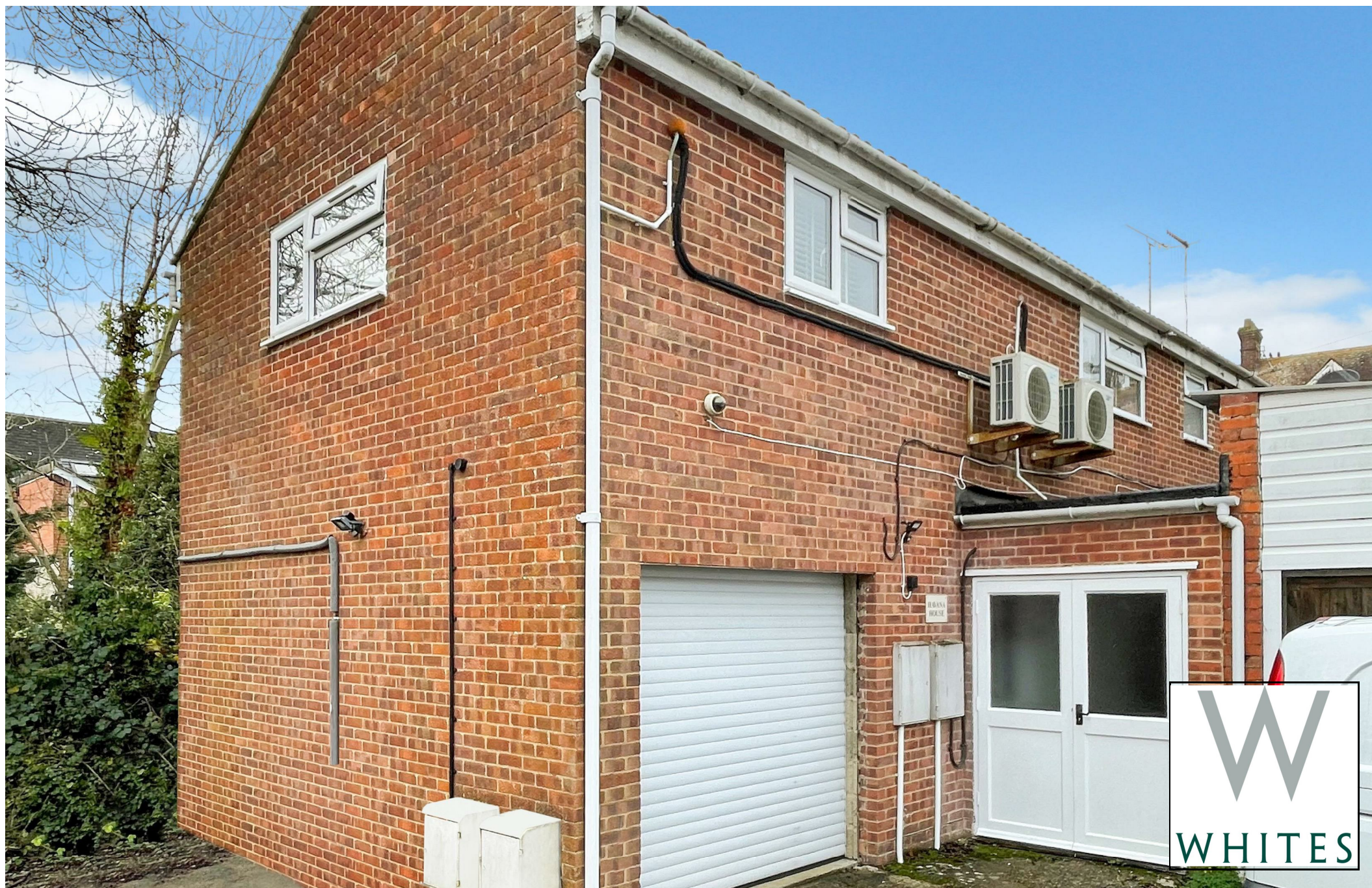
Havanna House, 31 Churchill Court, Wilton, Salisbury, Wiltshire, SP2 0HL