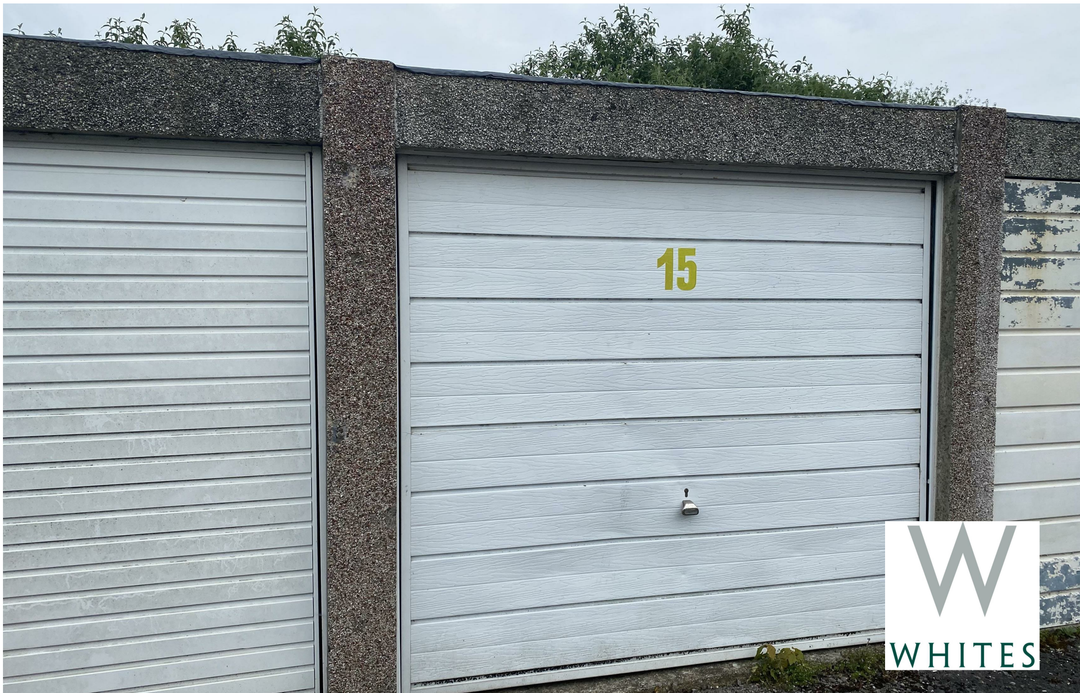
Garage 15 Syringa Court, Salisbury, SP2 7LB