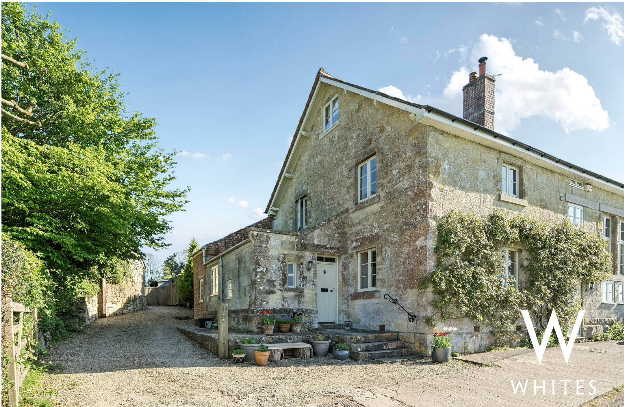
Guildhall Cottage, Wardour, Tisbury, Wiltshire, SP3 6RN