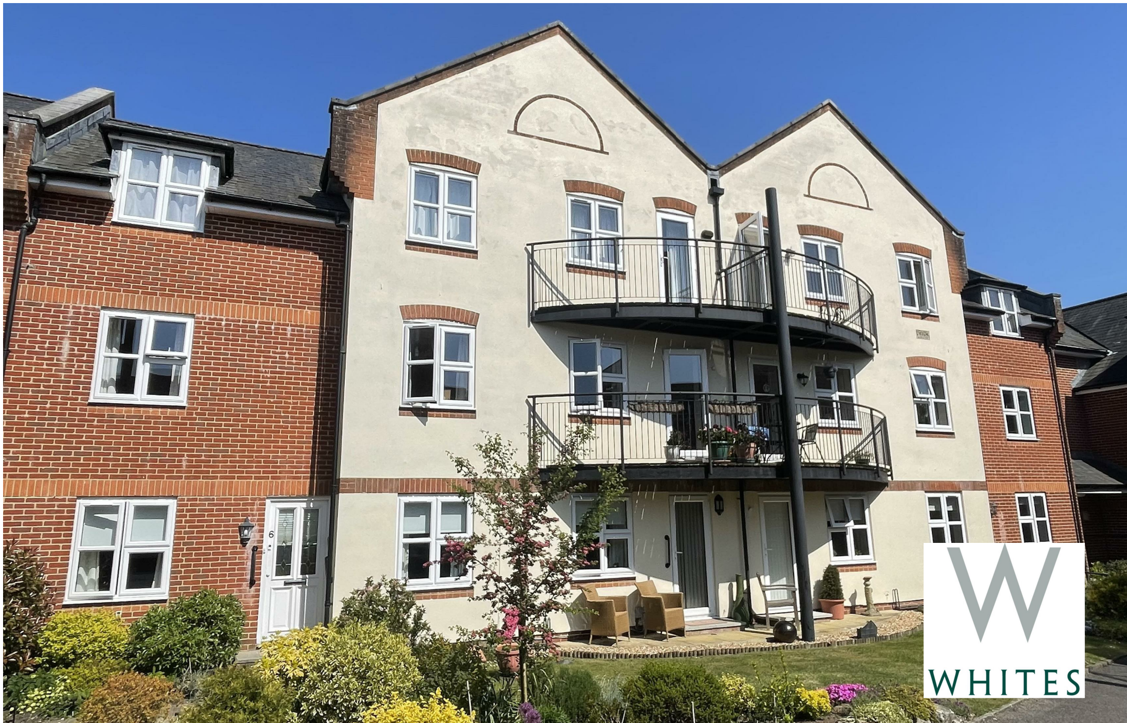
Flat 14, 49-61 St. Edmunds Church Street, Salisbury, Wiltshire, SP1 £325,000 Leasehold - Share of Freehold 1FD