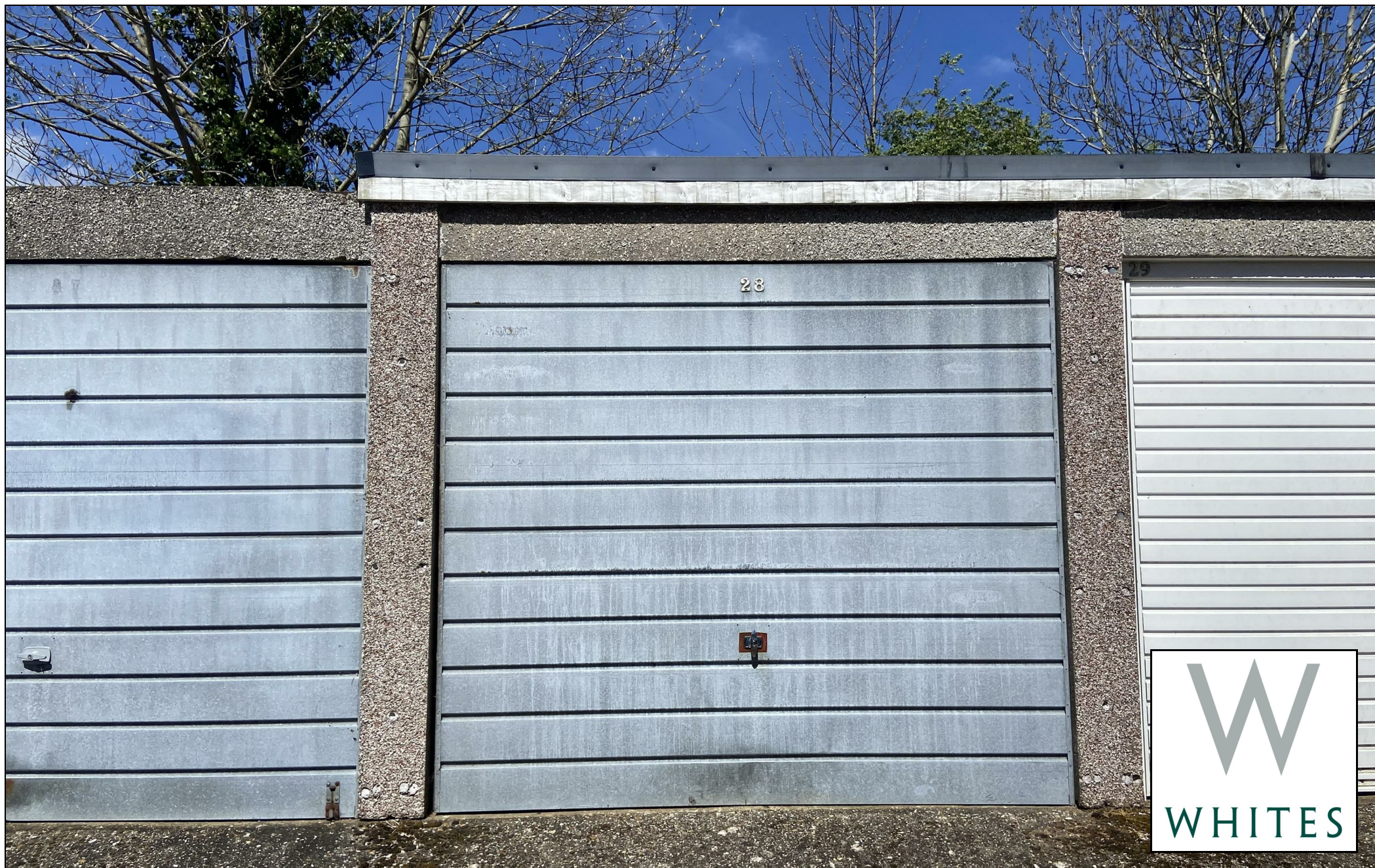
Garage 28 St Francis Road, Salisbury, SP1 3QP