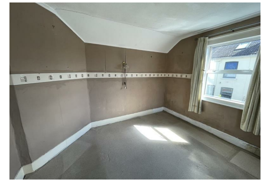
First Floor Approx. 31.1 sq. metres (334.8 sq. feet)