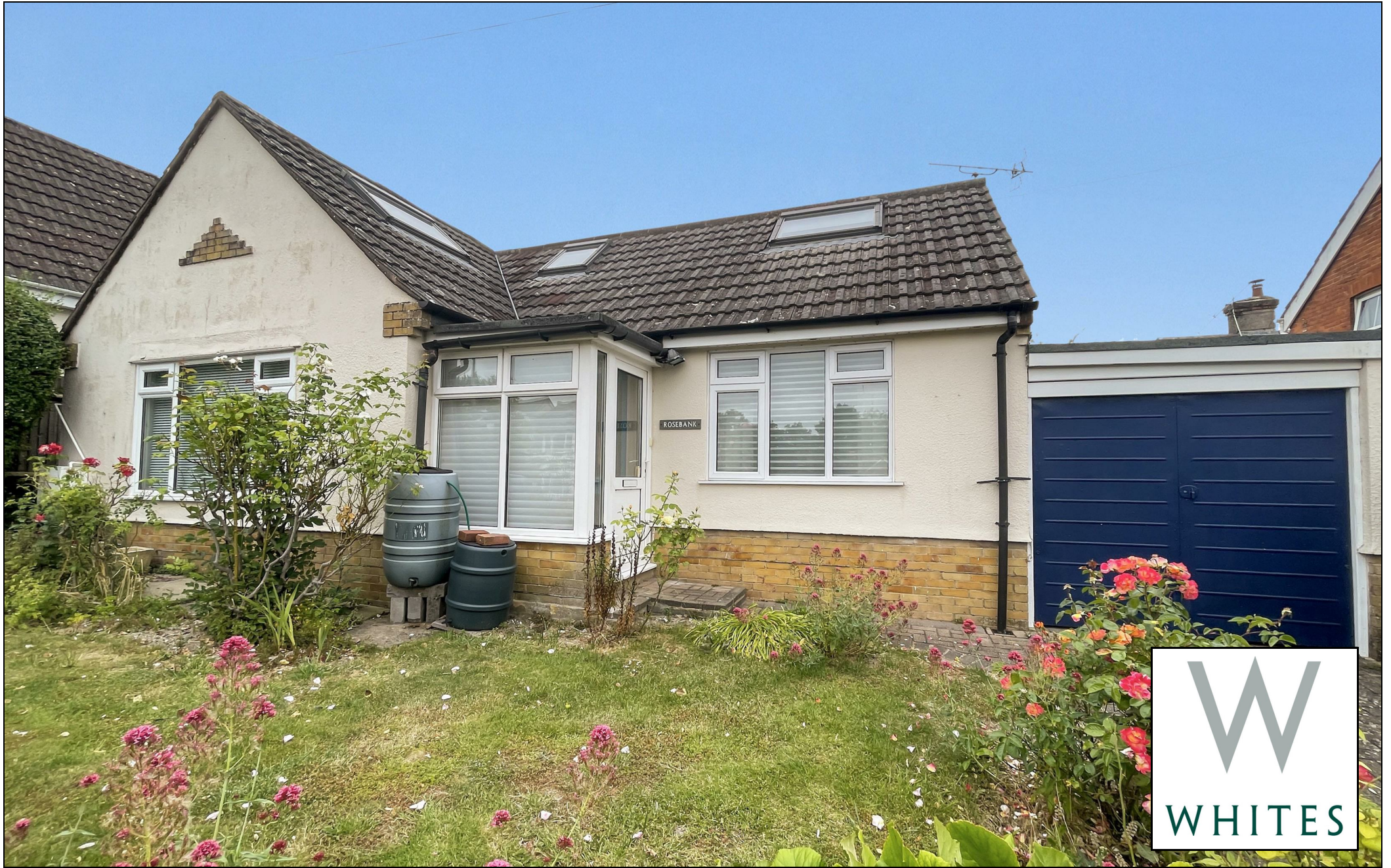
Rosebank 3 Cecil Avenue, Harnham, Salisbury, Wiltshire, SP2 8EE