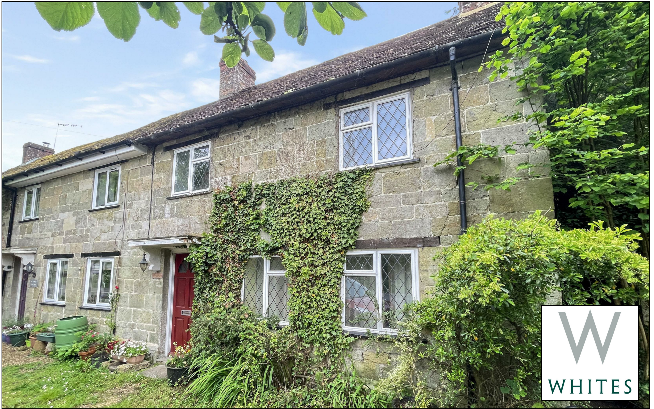
Postmans Cottage, Shaftesbury Road, Compton Chamberlayne, Wiltshire, SP3 5DJ