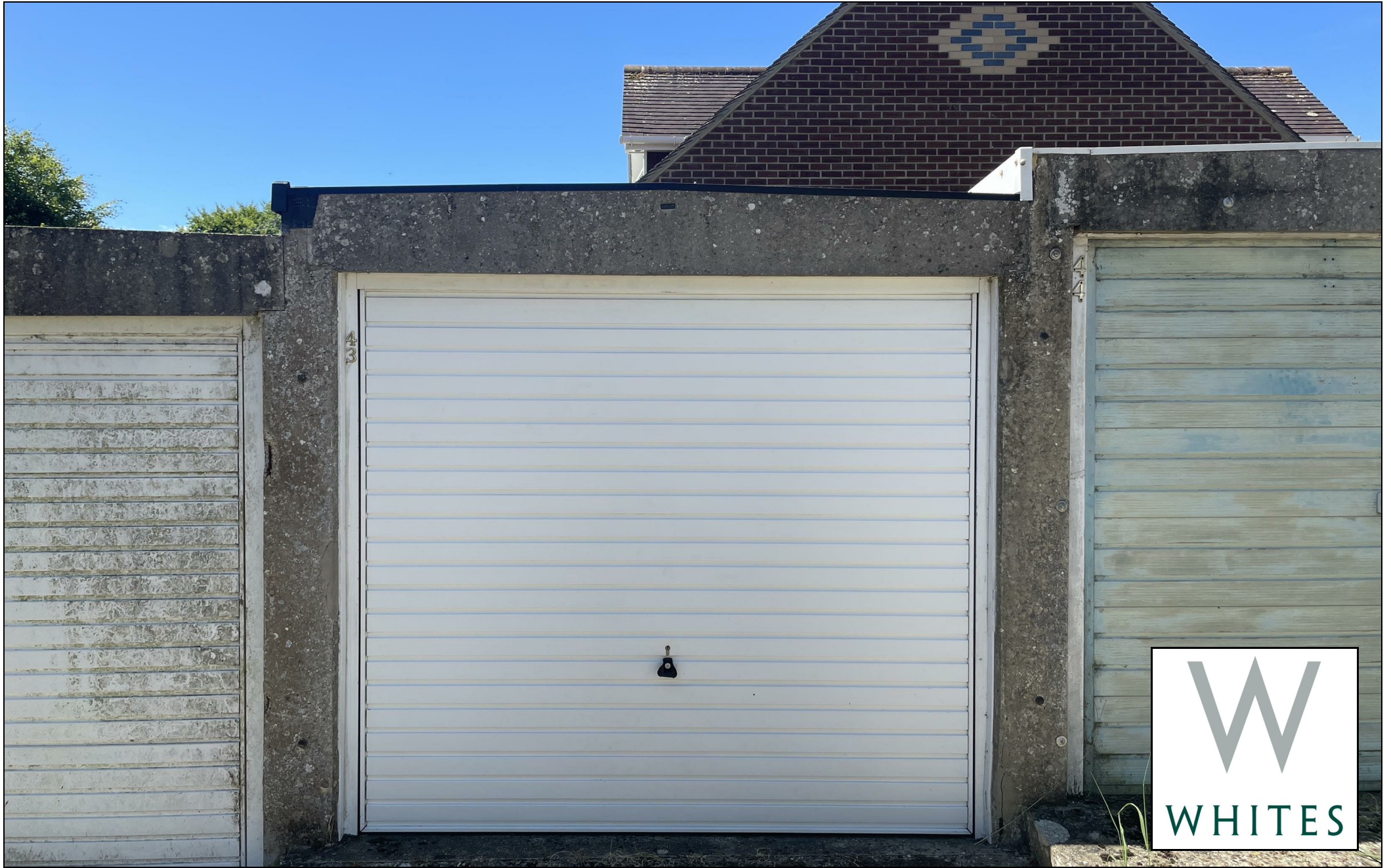
Garage 43, St Francis Road, Salisbury, Wiltshire, SP1 3QP