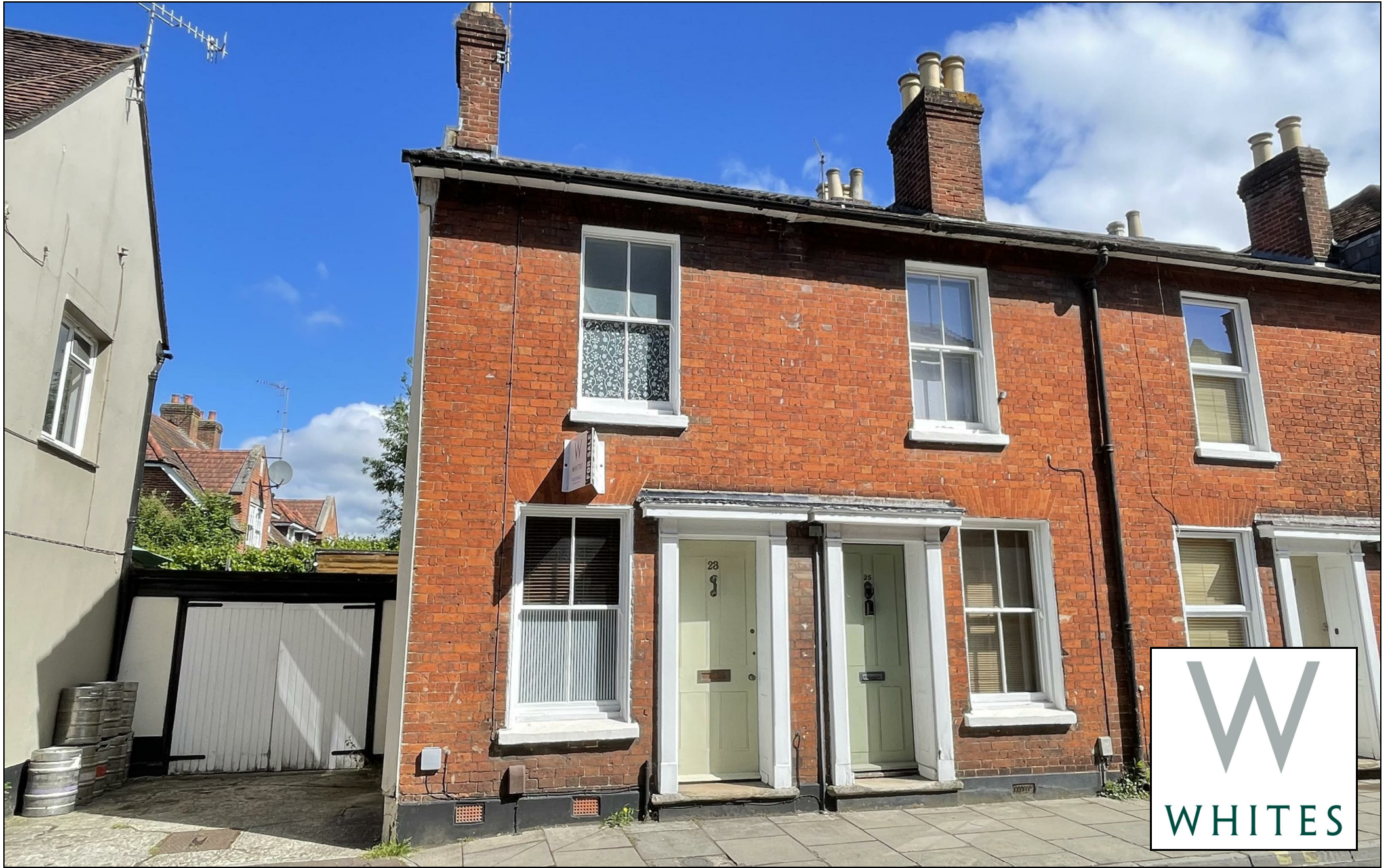
Painters Cottage, 23 Bedwin Street, Salisbury, Wiltshire, SP1 3UT