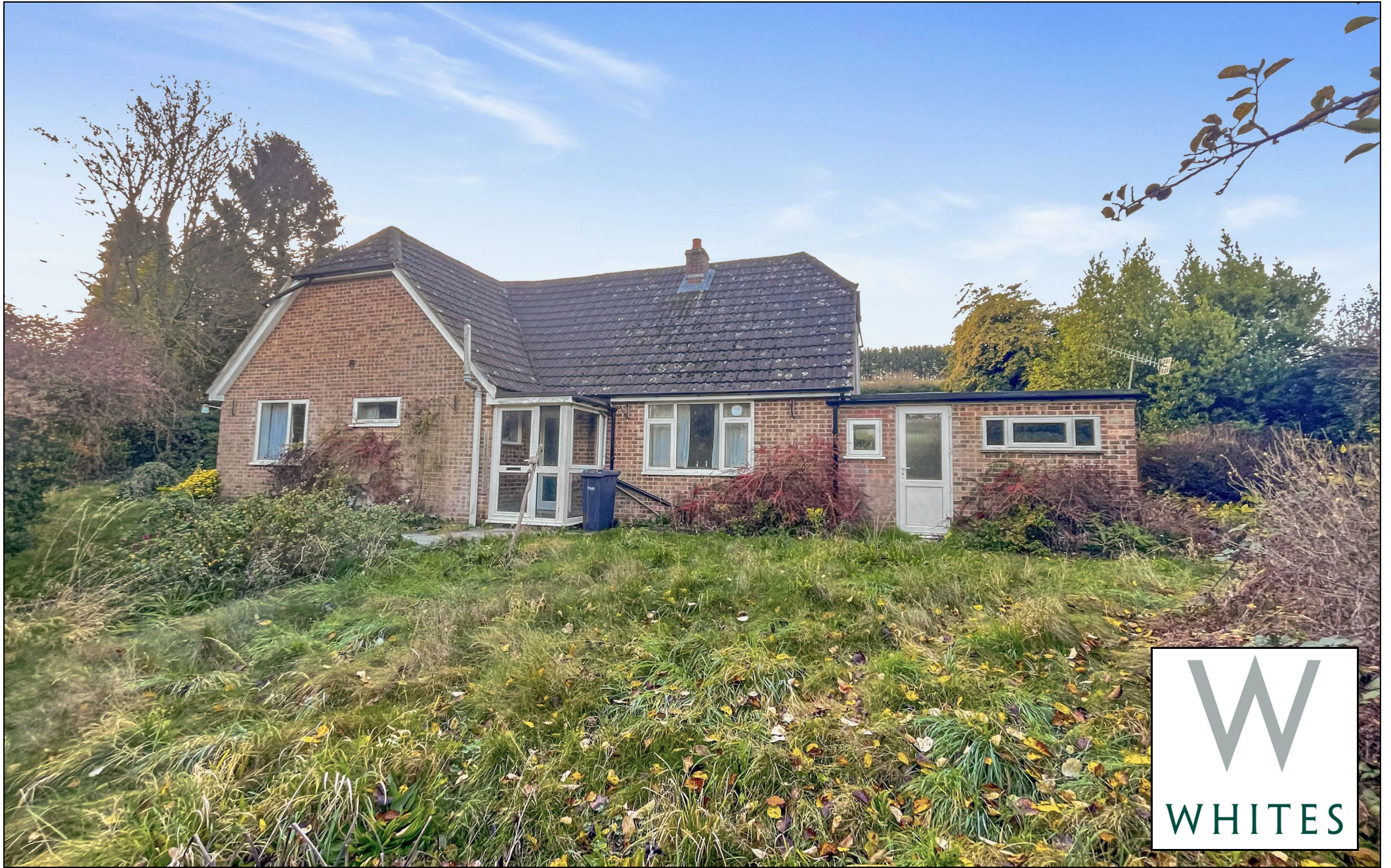
Cranborne Cottage Blandford Road, Coombe Bissett, Salisbury, Wiltshire, SP5 4LF