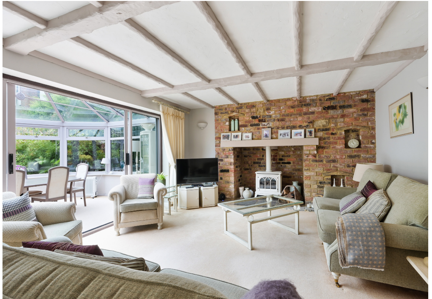
A fantastic five bedroom detached home on a highly regarded cul-de-sac in the idyllic village of Bletchingley.