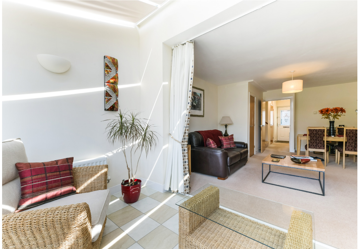
A modern two bedroom, two bathroom home with an impressive size living area, garden and garage en bloc.