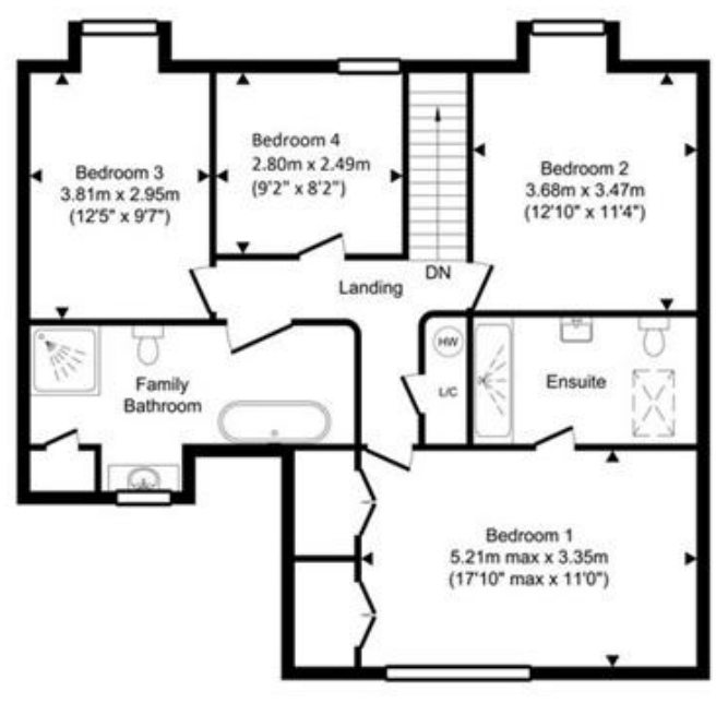
Ground Floor Approximate Floor Area 1096.73 sq. ft. (101.89 sq. m)