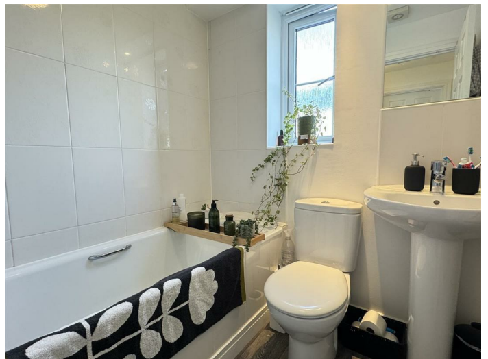
Bathroom 5'9" x 5'8" - maximum (1.77 x 1.74 - maximum)

Upvc double glazed window to front elevation with