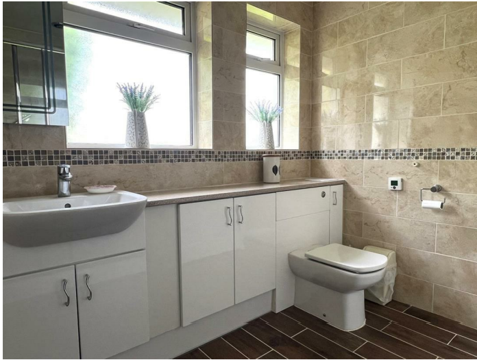
En-Suite 4'0" x 4'9" (1.22 x 1.45)