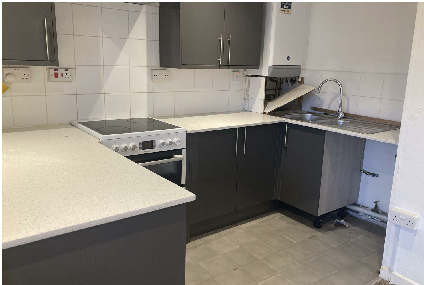
Flat 4, Sibbald House North Street, Fowey, PL23 1DB

The Location Fowey is regarded as one of the most attractive waterside communities in the county. Particularly well known as a popular sailing centre, the town has two thriving sailing clubs, a famous annual Regatta and excellent facilities for the keen yachtsman. For a small town Fowey provides a good range of shops and businesses catering for most day to day needs. The immediate area is surrounded by many miles of delightful coast and countryside much of which is in the ownership of the National Trust. Award winning restaurants, small boutique hotels, excellent public houses etc, have helped to establish Fowey as a popular, high quality, destination.