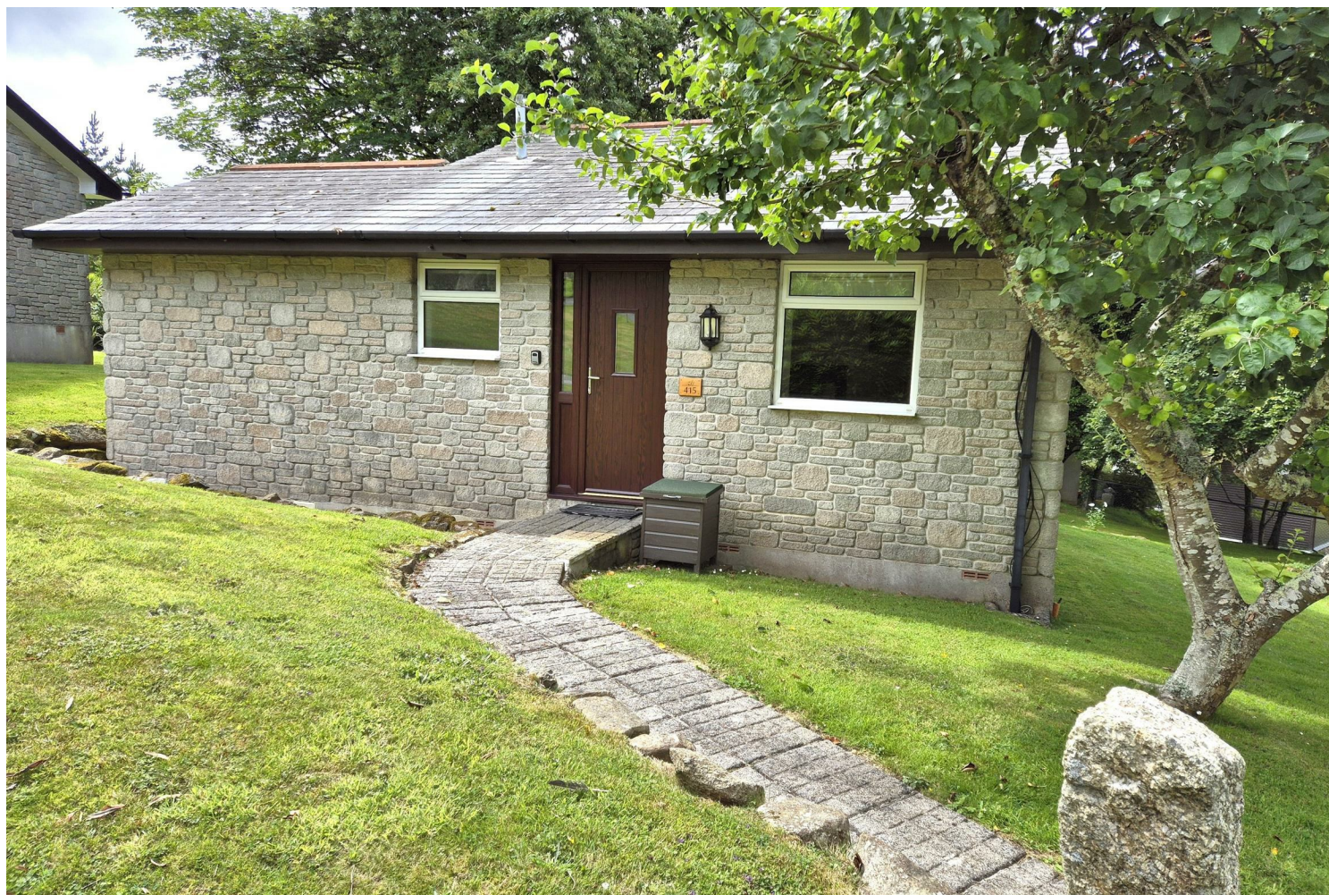
MAPLE, LODGE 415 Trenytho Manor, Tywardreath, PL24 2TS