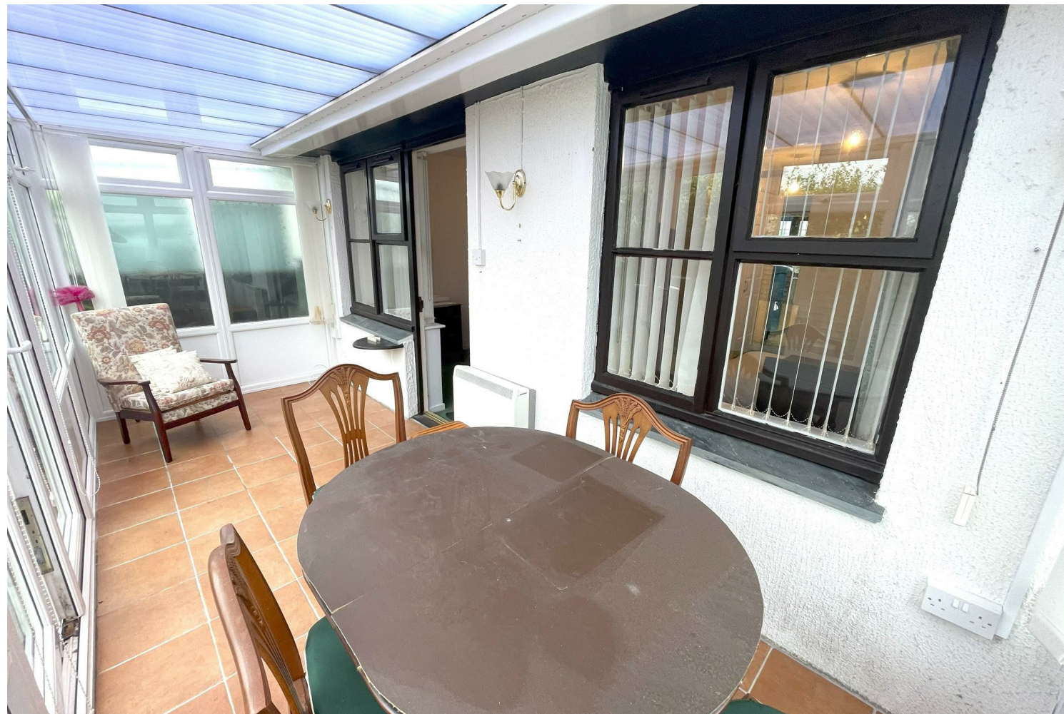
29 Briarfield's Rawlings Lane, Fowey, PL23 1DT