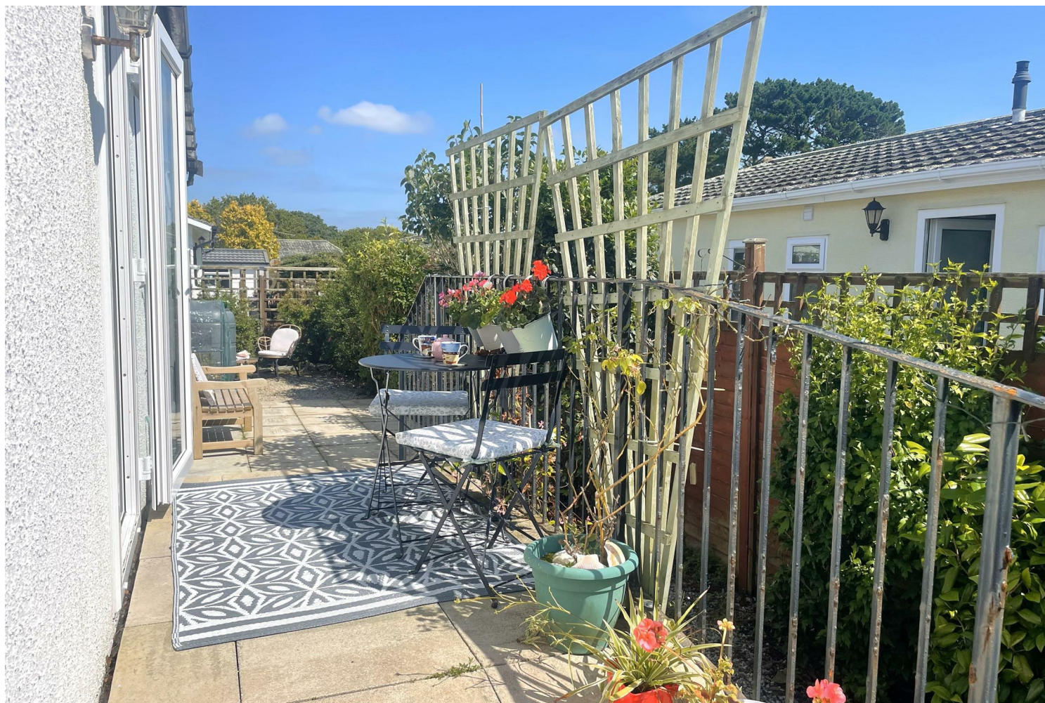
16 Polkerris Park Mountlea Country Park, Par, Cornwall, PL24 2JP