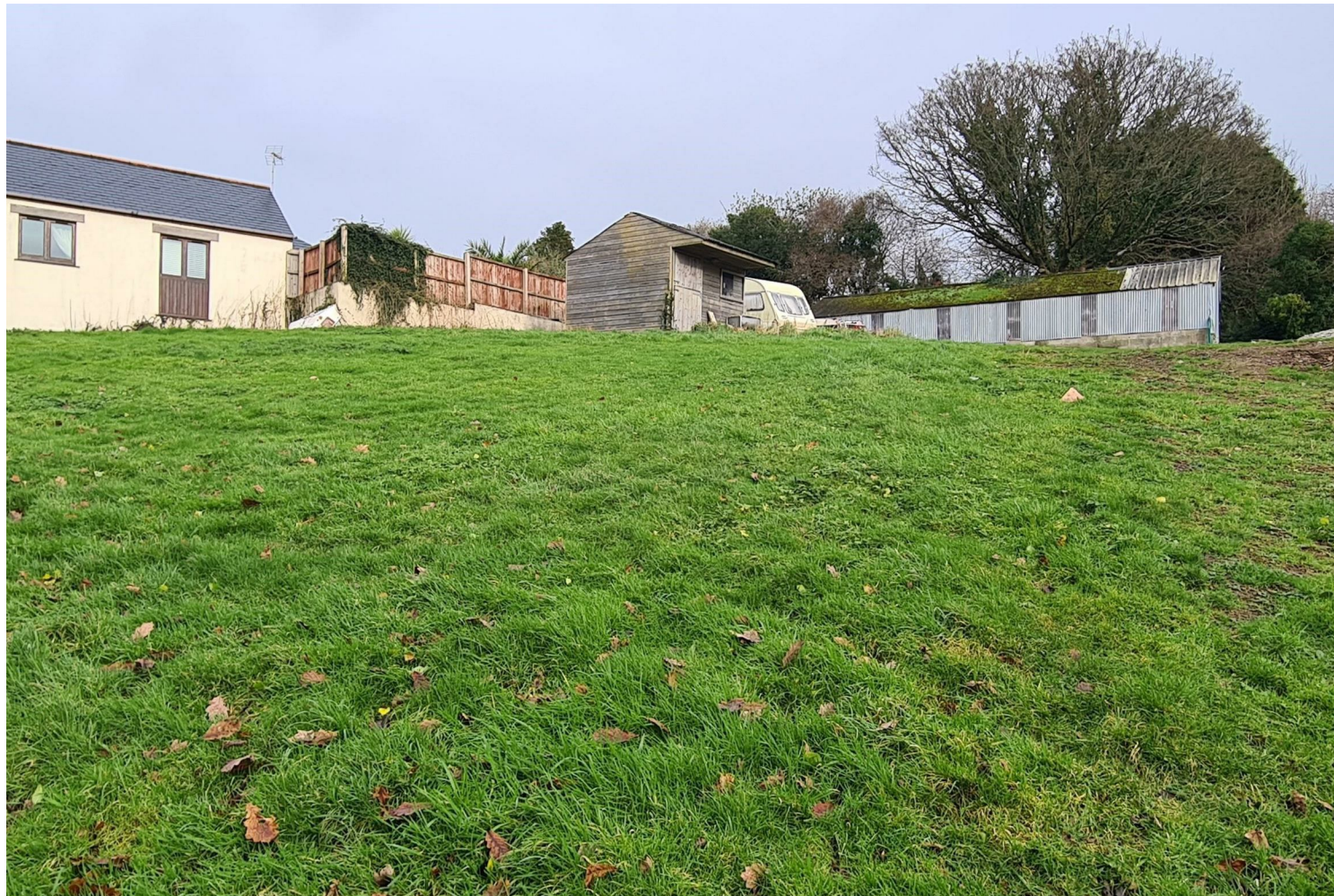
Plot at Hill Park Farm, Kilhallon Par, Cornwall, PL24 2RL