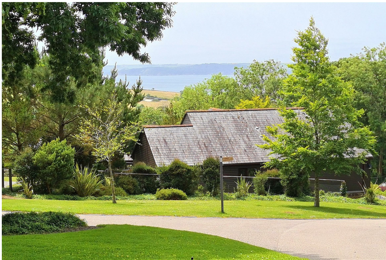
Lodge 413 at Trenytho Manor, Tywardreath, Tywardreath, Cornwall, PL24 2TS