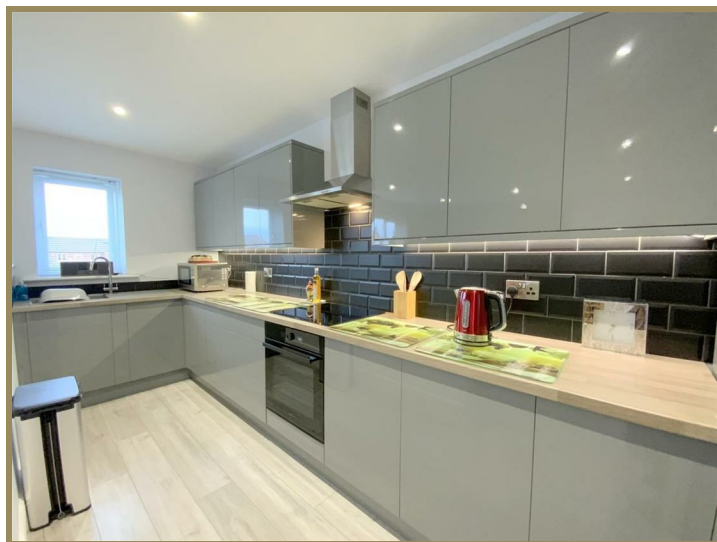
4 Roy's Drive, Tetney, DN36 5FS £196,000