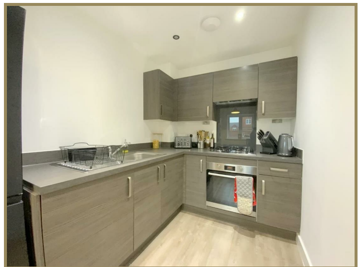
8A Sandgate Close, Scartho, North East Lincolnshire, DN33 3TD £145,000