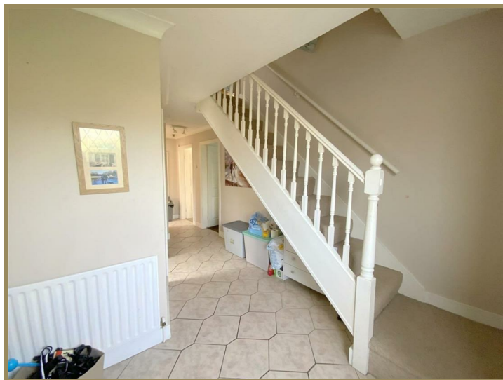
7 Old Fleet, Grimsby, North East Lincolnshire, DN37 9RT £160,000