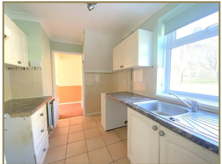
78 Dyke Road, North Cotes, Lincolnshire, DN36 5XH £90,000