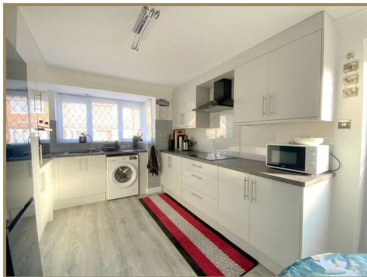
3 Oderin Drive, New Waltham, North East Lincolnshire, DN36 4GJ £205,000