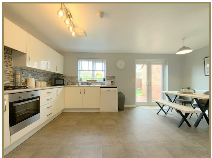
6 Jersey Place, Immingham, North East Lincolnshire, DN40 1PZ £215,000