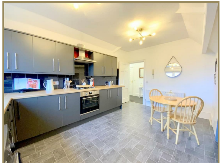
8 The Mount, Mill Road, Cleethorpes, North East Lincolnshire, DN35 8JD £151,500