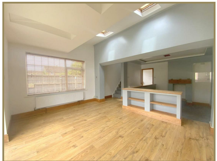
28 Marsh Way, North Cotes, Lincolnshire, DN36 5XJ £95,000