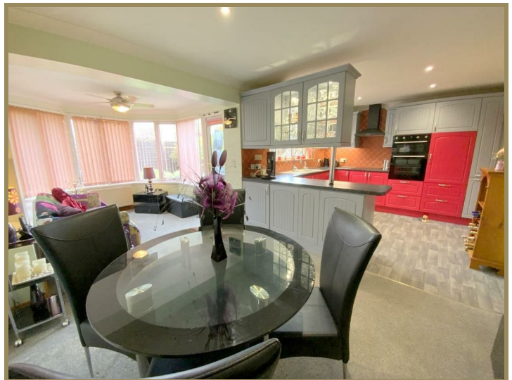
Shanti Nilaya, Stansfield Gardens, Immingham, North East Lincolnshire, DN40 2RH