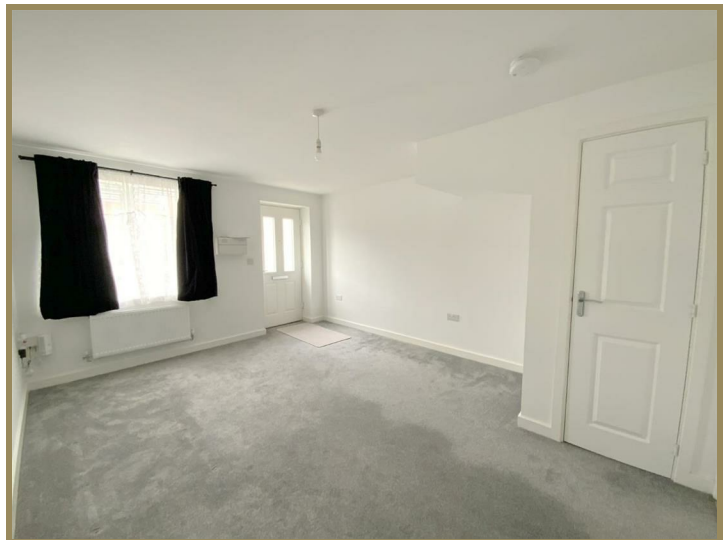
10 Eagle Drive, Humberston, North East Lincolnshire, DN36 4ZL £185,000