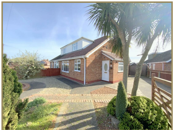
1 Walesby Close, Scartho, North East Lincolnshire, DN33 3HQ £170,000