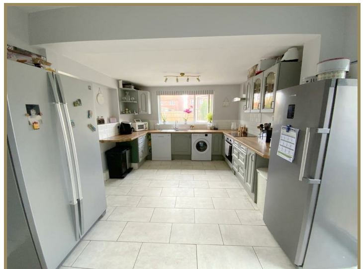
3 Clay Lane, Holton-Le-Clay, Lincolnshire, DN36 5AG £210,000