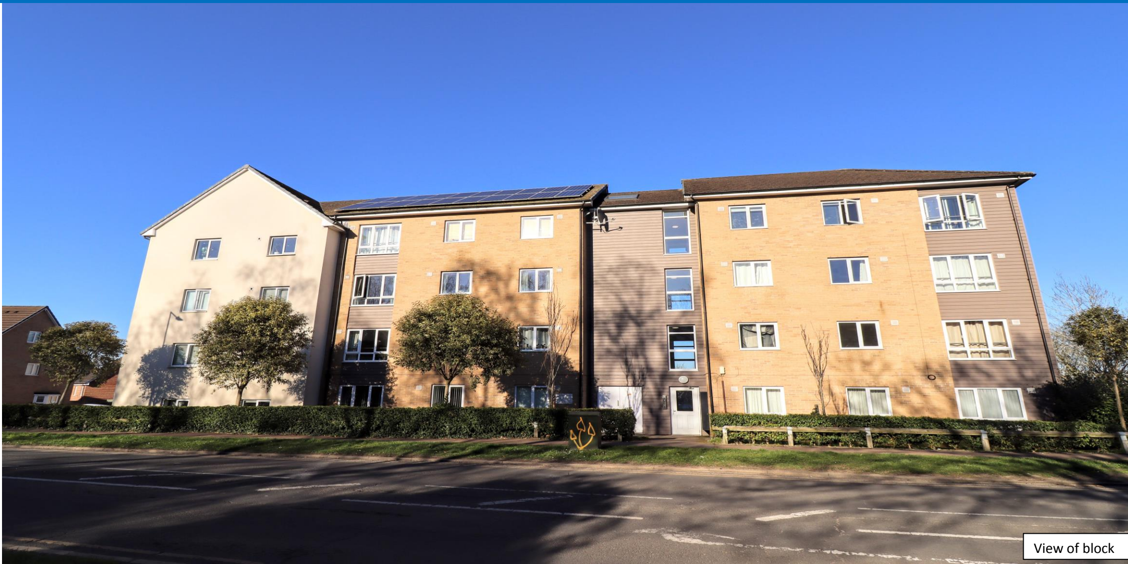
View of block