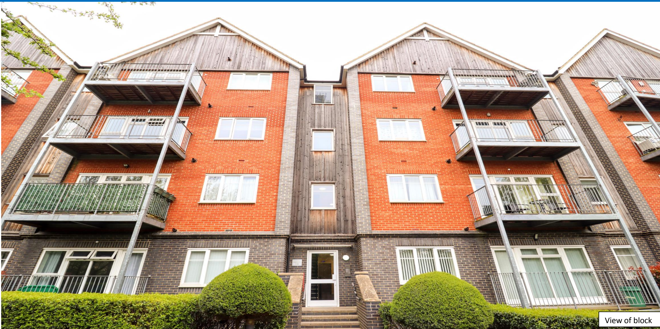
View of block