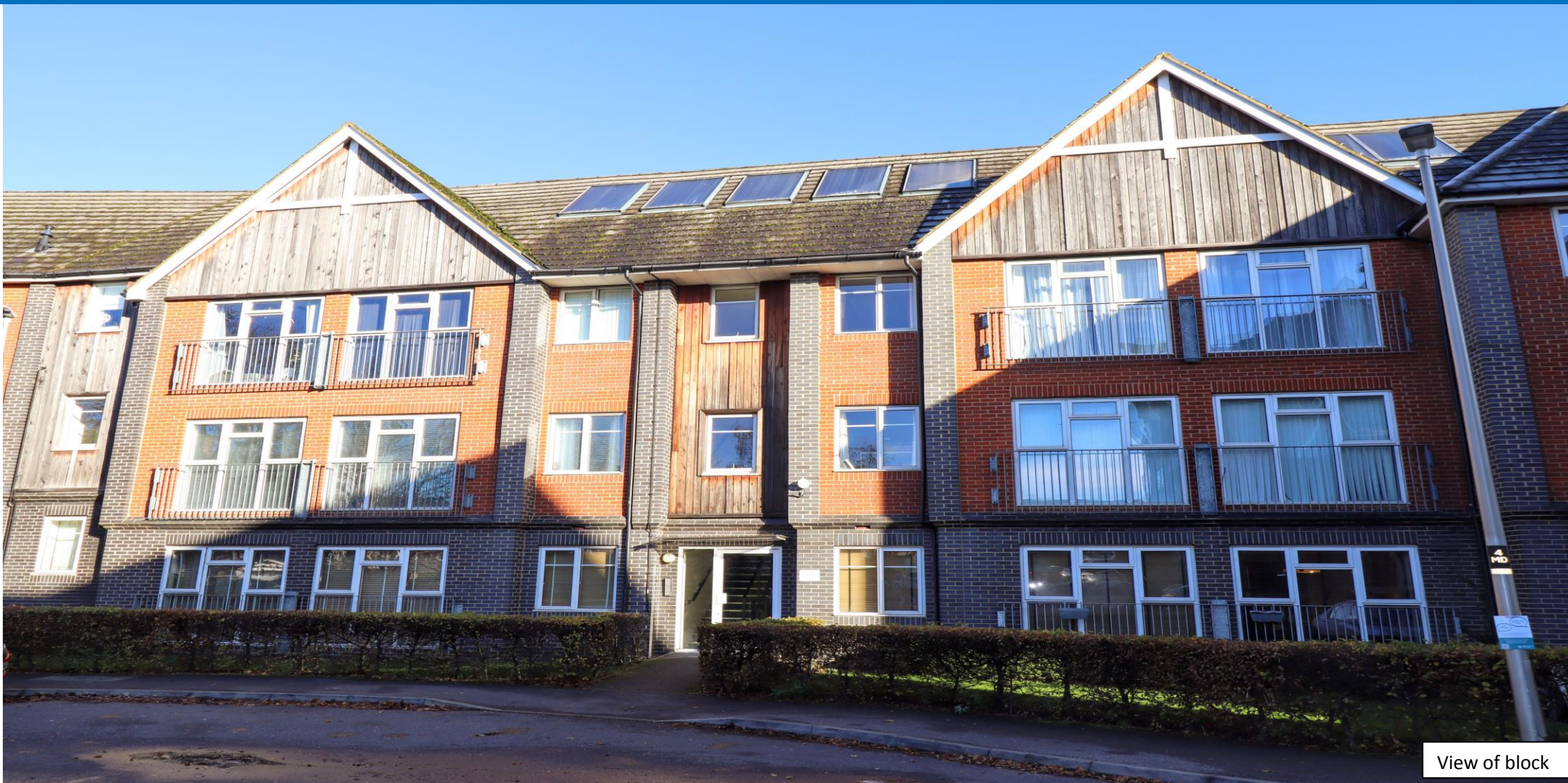
View of block