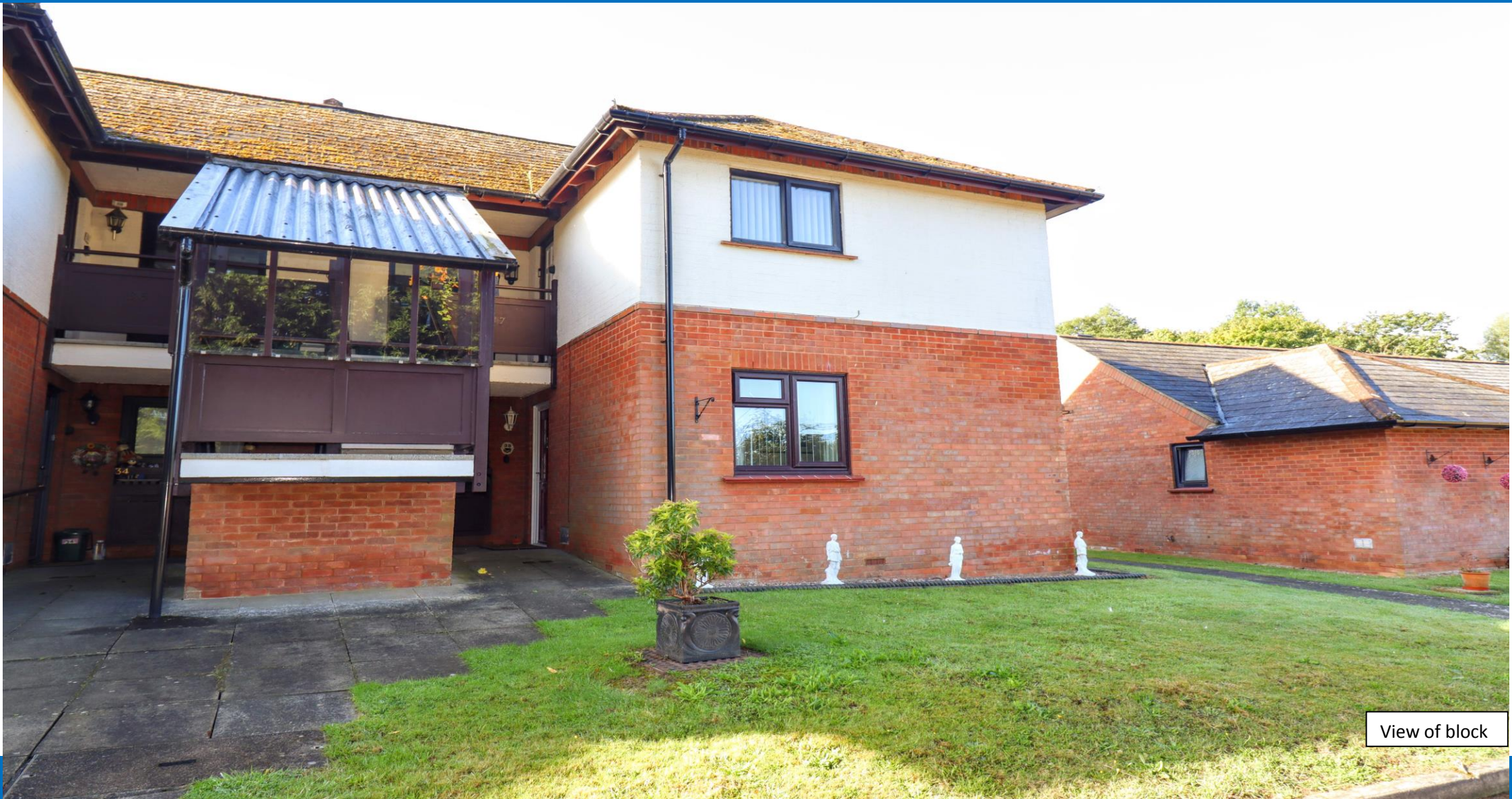
View of block