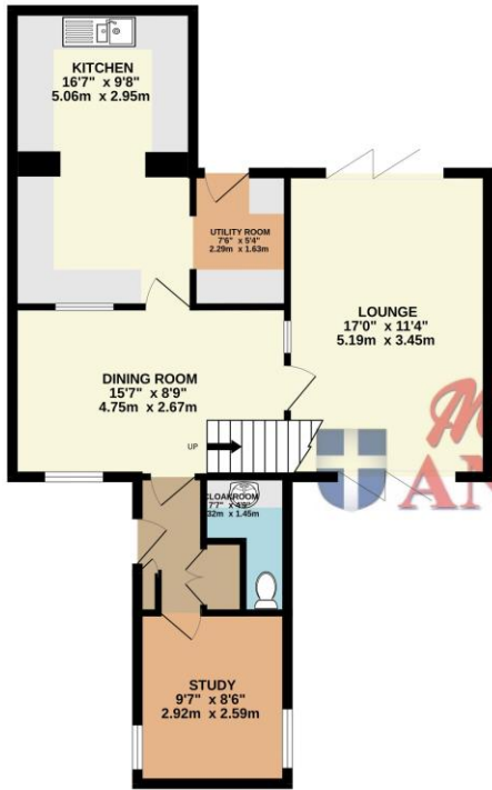
GROUND FLOOR 692 sq.ft. (64.3 sq.m.) approx.