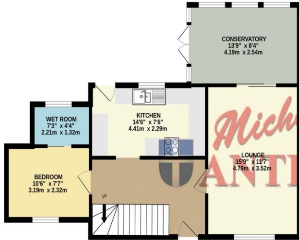
GROUND FLOOR 635 sq.ft. (59.0 sq.m.) approx.