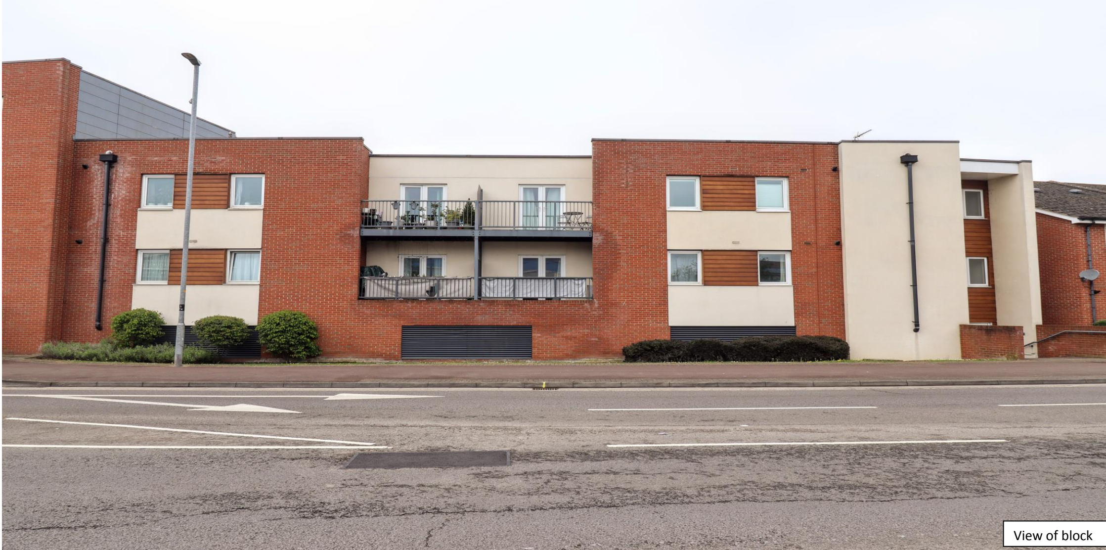
View of block