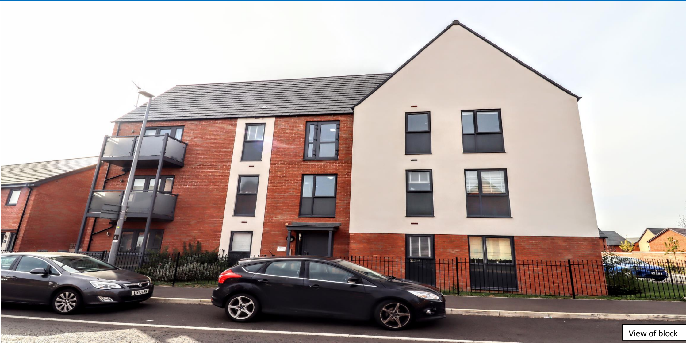
View of block