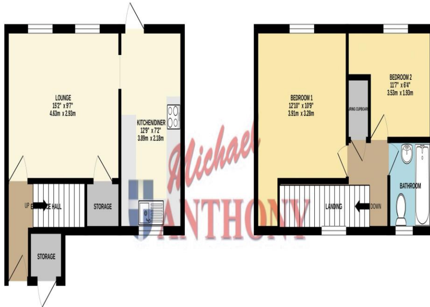
1ST FLOOR 301 sq.ft. (27.9 sq.m.) approx.

TOTAL FLOOR AREA : 626 sq.ft. (58.1 sq.m.) approx.