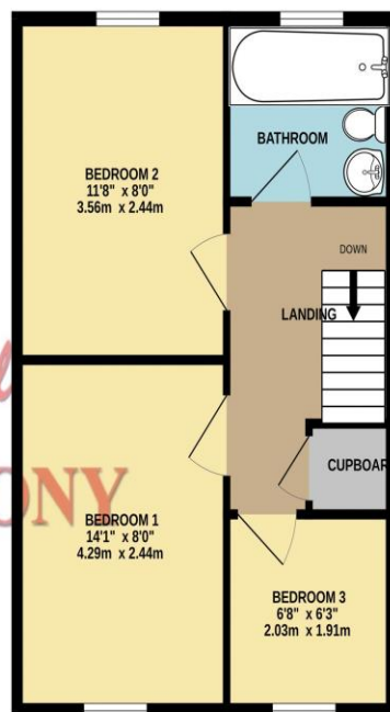
1ST FLOOR 526 sq.ft. (48.9 sq.m.) approx.