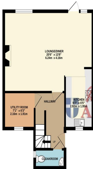
GROUND FLOOR 445 sq.ft. (41.3 sq.m.) approx.