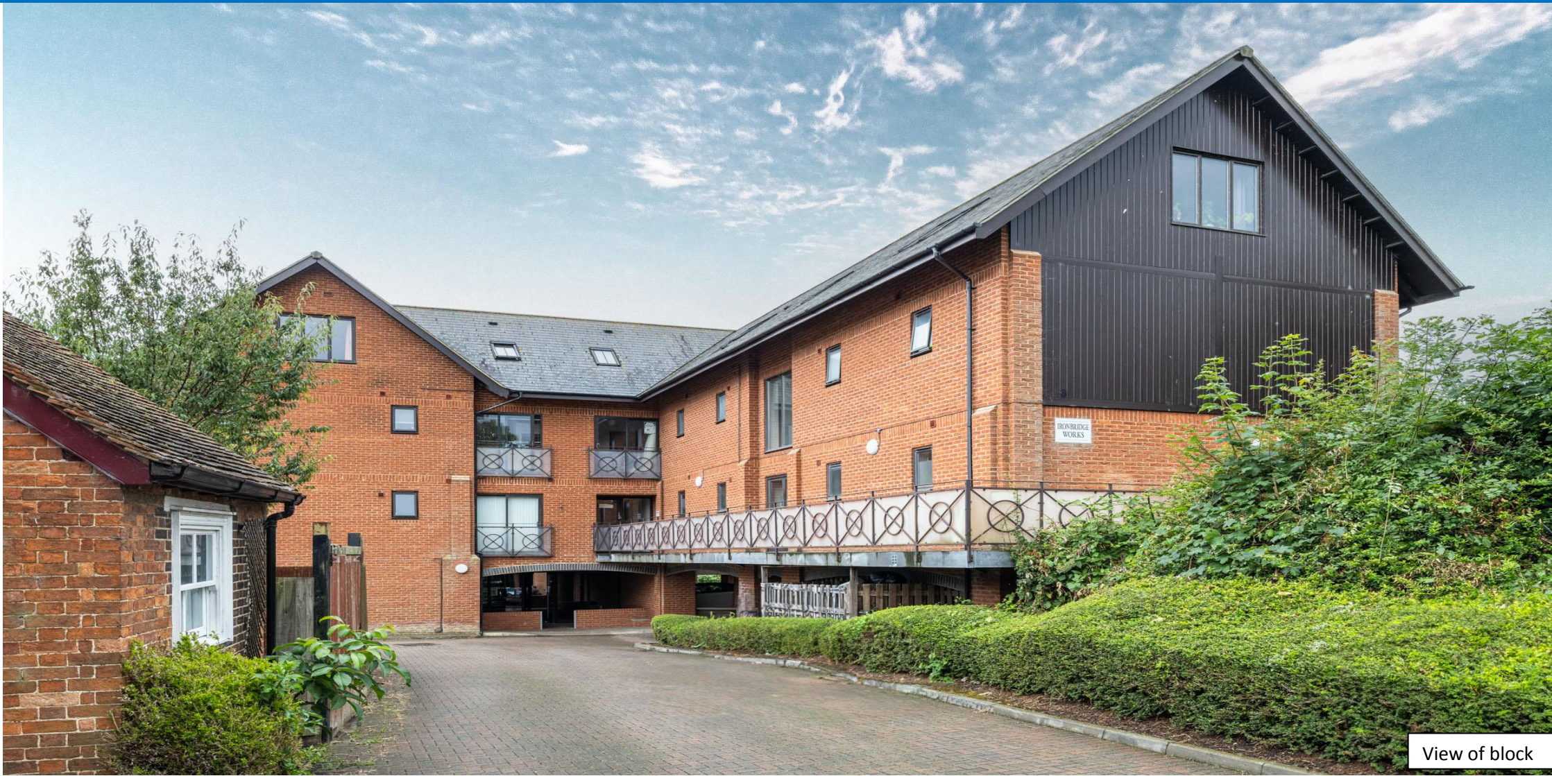
View of block