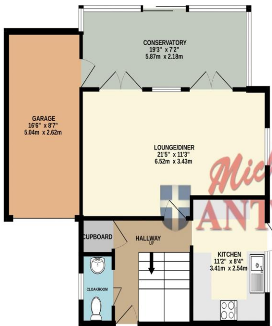
GROUND FLOOR 724 sq.ft. (67.3 sq.m.) approx.